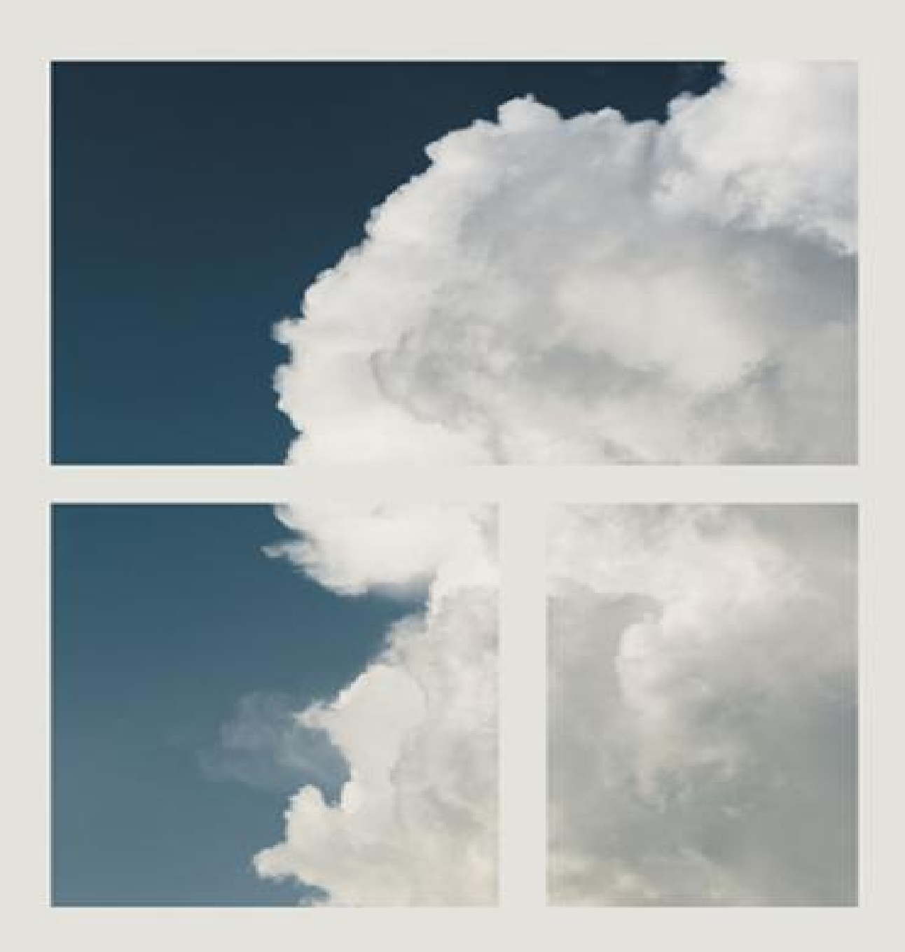
God Transcendent AND OTHER SELECTED SERMONS